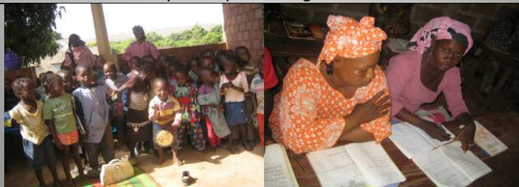
Profits generated by the AGR May 2010 to February 2011