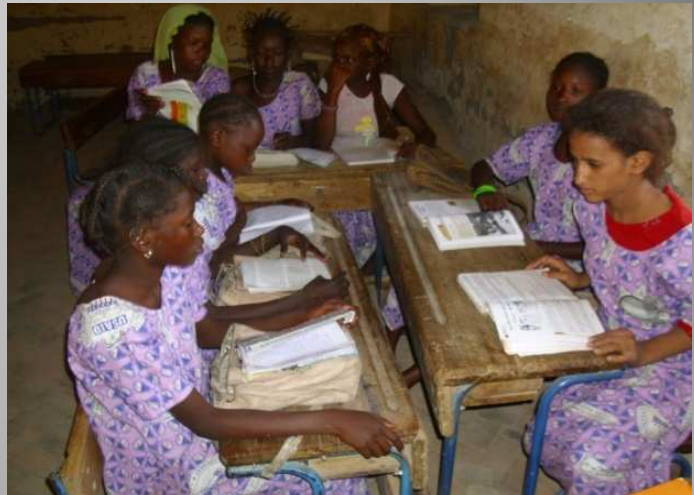
A group of young schoolgirls in Tombouctou.