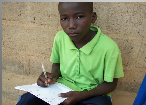
A scholarship recipient from Gao.